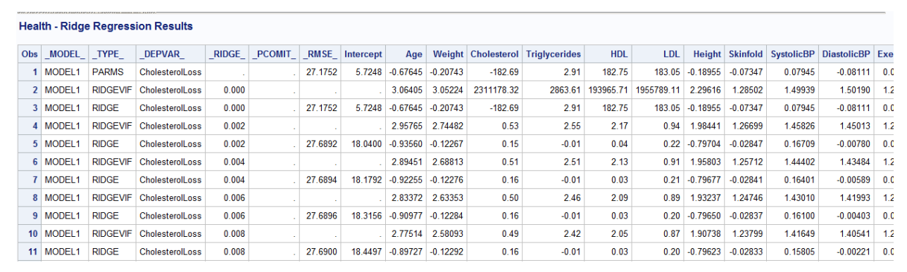
Figure 7: Ridge Regression Results

From these results we want to derive the appropriate ridge parameter or "k" to include in the analysis. The ridge parameter column is labeled _RIDGE_ and the associated values under each variable column are the new parameter estimates. There are several schools of thought concerning how to choose the best value of "k". I recommend reading Dorugade and Kashid's 2010 paper for more information on this matter. For the sake of time and brevity, the current paper will simply look at the least increase in _RMSE_ and a decrease in ridge variable inflation factors for each variable. In order to achieve this, we need not look far, as the ridge parameter of .002 increases the _RMSE_ only slightly from 27.1752 to 27.6894 and drops the VIF for each of our problem variables to below our 10 cutoff. Therefore, this study will choose the ridge parameter of .002 for the resulting parameter adjustments which are completed in the following code: