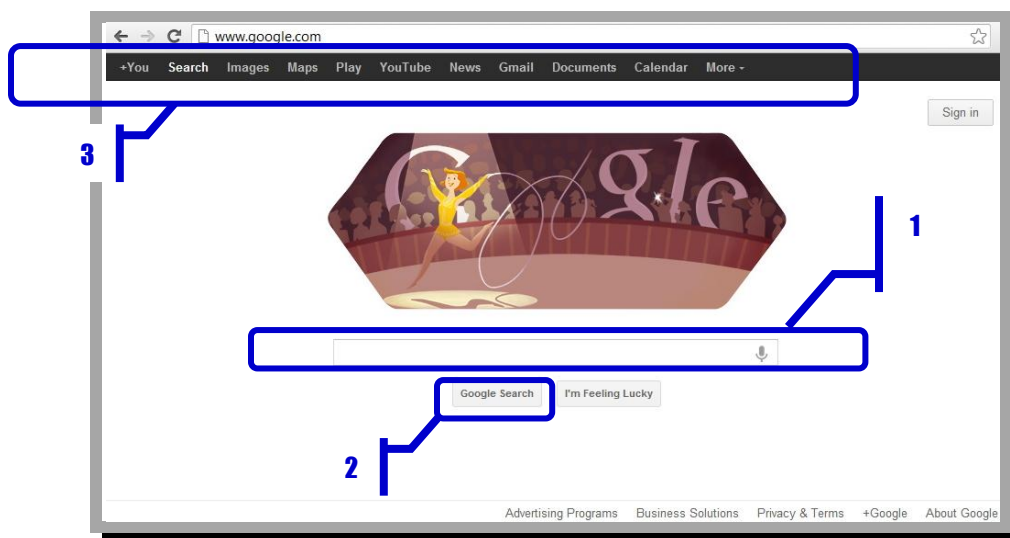
Figure 1. The Google User Interface

Google's "free" and easy-to-use Internet search service begins with a very familiar user interface (or home page). Using a web browser such as Google Chrome®, Mozilla Firefox®, Internet Explorer®, or Safari®, the web address, www.Google.com , is entered as shown in Figure 1. By entering a keyword (or phrase) in the search box (section 1) and clicking the "Google Search" button (section 2), a basic user-initiated search can be requested. In addition to using the Google home page to search relevant results on the World Wide Web, users are also able to perform specific searches (i.e., You, Search, Images, Maps, Play, YouTube, News, Gmail, Documents, Calendar, and More) by clicking the links located at the top of the Google page (section 3).