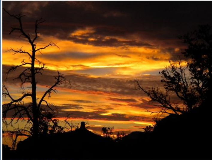
Caption: The sky at night in Sedona

Note: If your mouse pointer appears as a hand when you move it over a picture, left-click your mouse to have Google Earth show the location of where the picture was taken