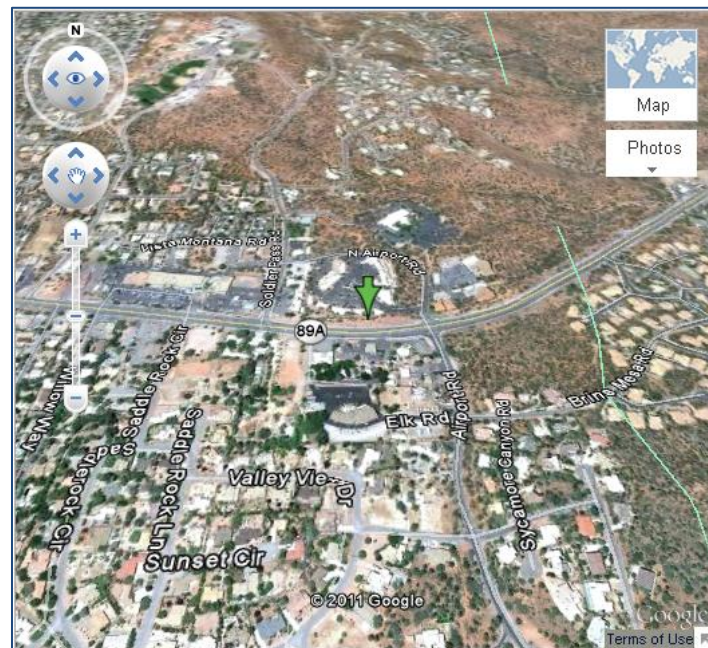
Figure 2 – Example Google Map resulting from running the program's code

If you then click on any picture that includes GPS coordinates, a screen like the one shown, below, will appear: