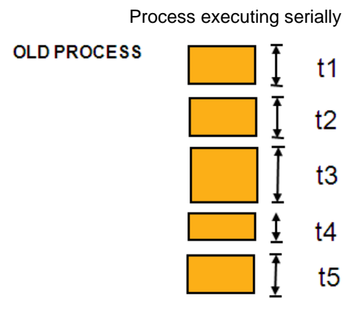
Total time (ta) = t1 + t2 + t3 + t4 + t5