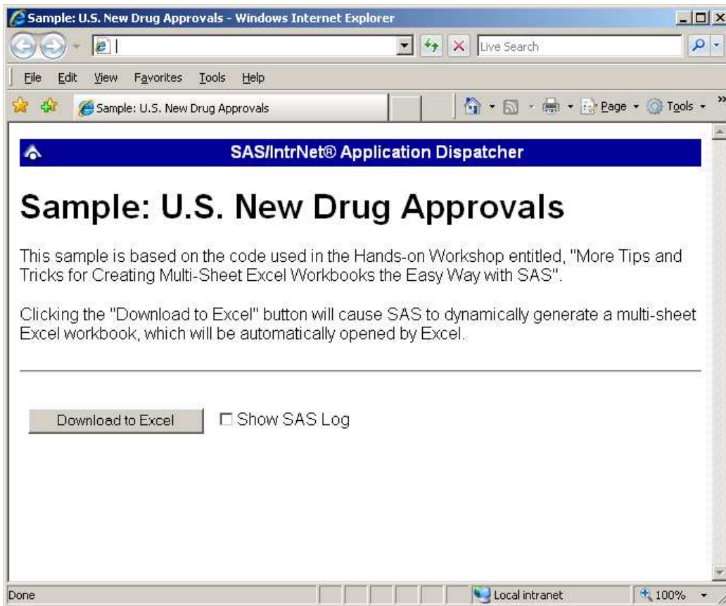
Figure 9. Web Page to Drive a SAS/IntrNet Application

Clicking "Download to Excel" executes a slightly modified version of the PRINT procedure code that we have been working on. The modifications are as follows: